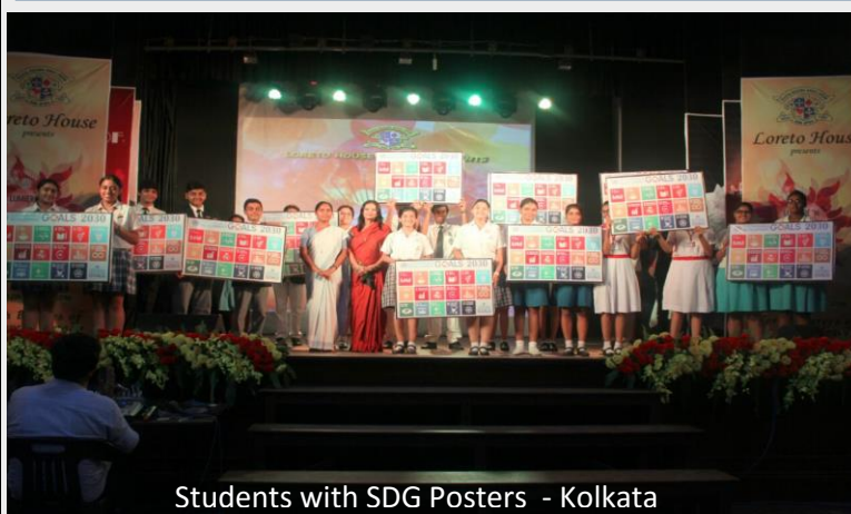
Students with SDG Posters - Kolkata