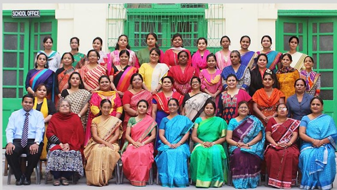
Teaching staff at Loreto Dharamtala, Kolkata.

of a child being a global citizen”. Click here to read about the ways in which the integrate values and practices conducive to the education of young global