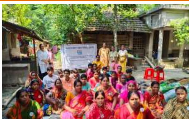
Anti-Human Trafficking Project