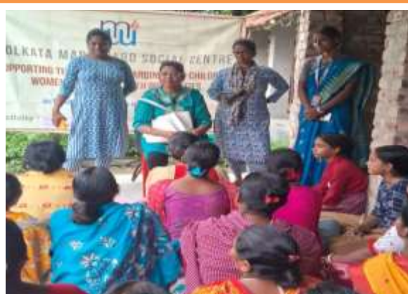
Human Rights Project