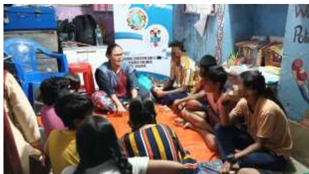
Red Light Project