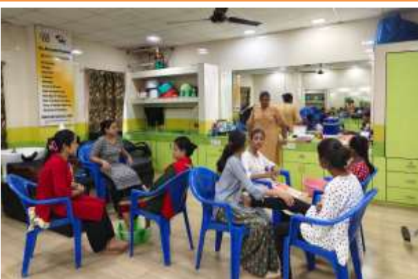
Skill Development Project