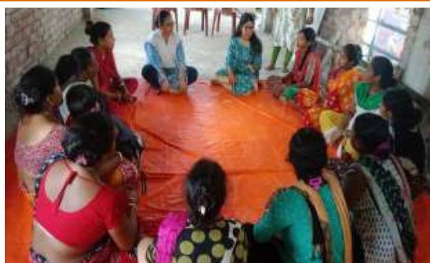
Kolkata Slum Project